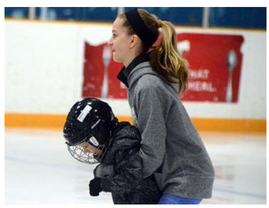
Participating in the London Skating Club Junior Olympics