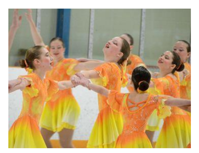
LSC Synchronicity Juvenile Team During The LSC Winter Showcase